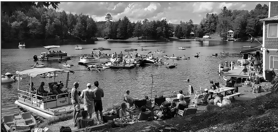
Music on Woodbury Lake -- Everyone is Welcome to Paddle Over