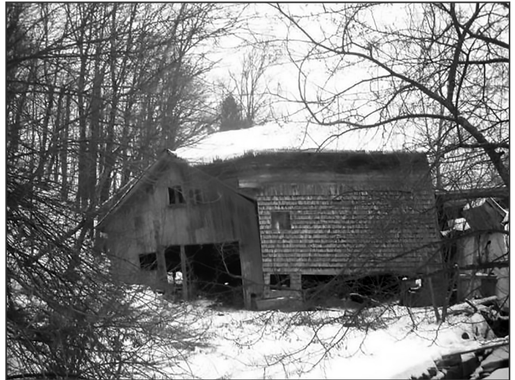
The barn was not worth saving or of historical value.

Funding to re-construct the stream channel was deleted from the grant at one point, so we will re-assess whether that will be advisable or necessary, next spring. Meanwhile a grant application to the Woodbury Fund is being prepared for landscaping of the site.