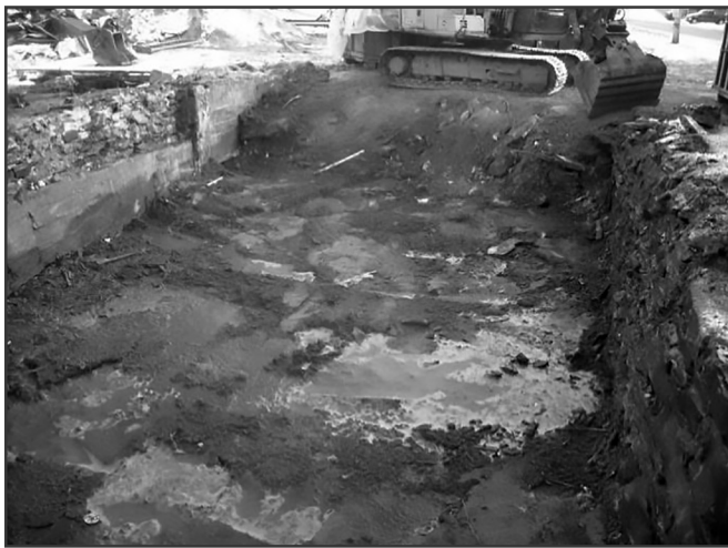
Foundation Scraped Clean As Part of Asbestos Removal