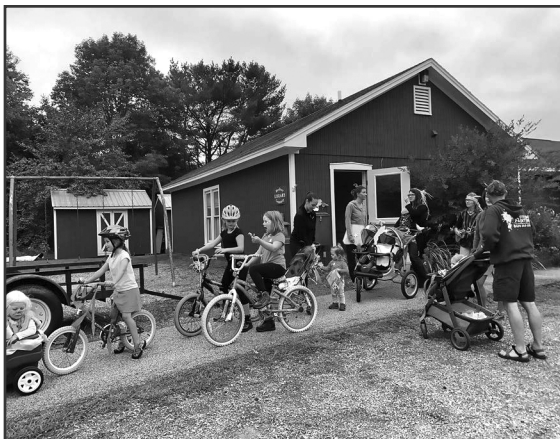
The Children's Parade at Old Home Days