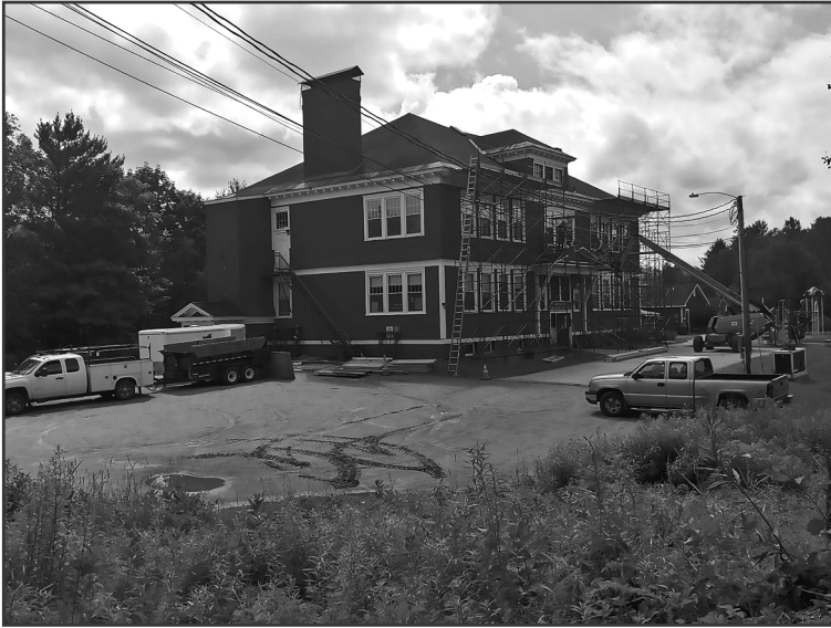
The School got a New Roof.