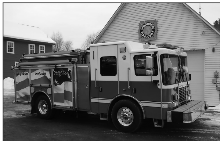
New Rescue Pumper