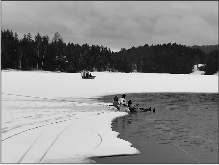
Ice Rescue Training

The budget overall is decreasing by .7% this year. (-$797) Woodbury's portion for operating expenses will be decreasing by ($2046) and Calais will be increasing by $1,248.