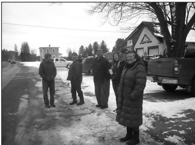
Sidewalk Superintendents -- December 2019