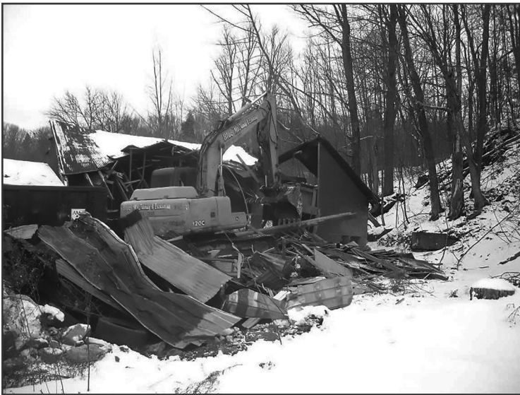
First Day of Demolition

This should be the final report on the status of the FEMA Hazard Mitigation Grant to remove the former “Woodbury Country Store”!!!