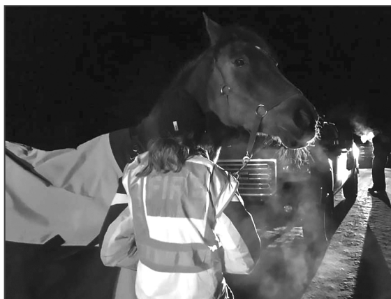
Milo the horse was rescued from the woods by Woodbury Volunteer Firefighters with help from a drone.