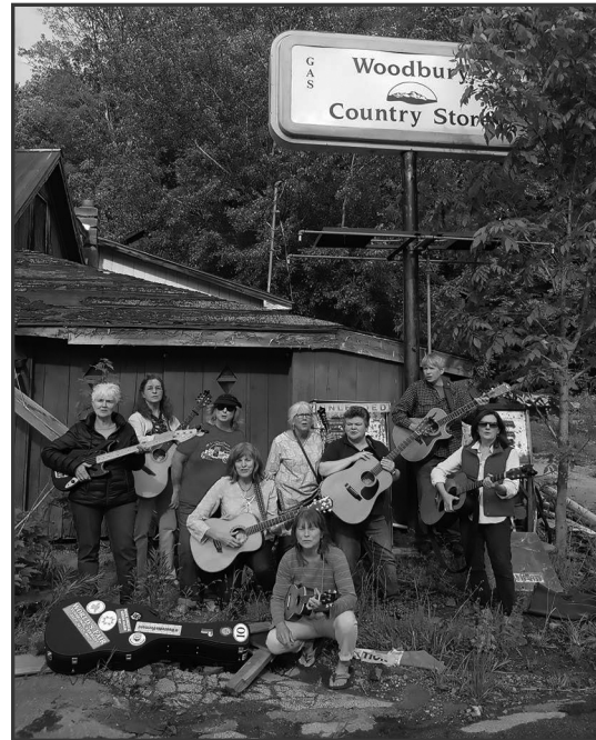
The Woodbury Broad Band – last gasp for the Woodbury Country Store.