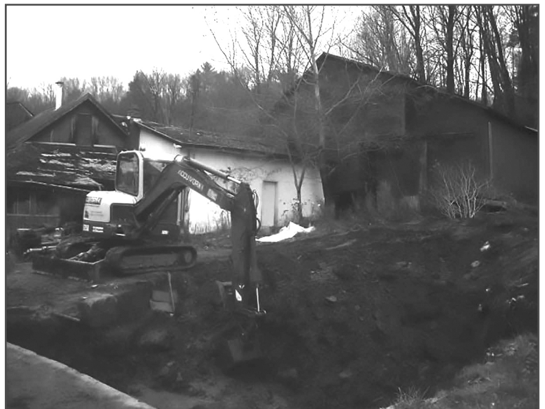
Removing Contaminated Soil -- November 2018

The total cost of the project (not including the two amounts noted above) will be $190,550, including costs for various studies, legal, engineering, advertising, purchase of the